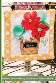
Machine Embroider by Number™: Pieced Bloom