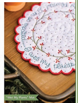
"Wet My Plants" Mat

All designs are stitched in a 5x7 or 6x10 hoop, with additional sizes available.