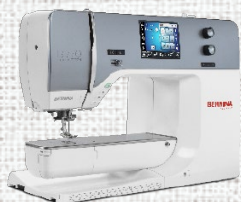
B770 QE PLUS without embroidery module

> SAVE $2,000 OFF a NEW B770 QE PLUS when you trade in your B830 / B820 QE / B780 Excludes Crystal Edition Machines