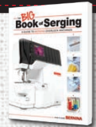
BIG Book of Serging

Come test drive a ONE-STEP AIR THREADING serger and be entered into a FREE Machine Drawing!