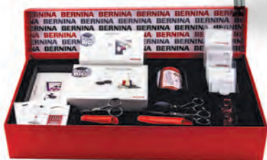
Q Series Accessory Bundle